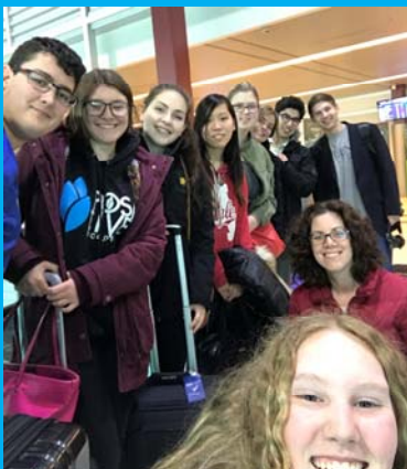
AP students attend a Students as Researchers (Star) Conference in Thunder Bay this past November.