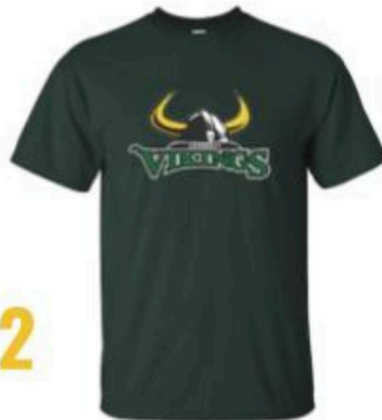
Cotton T-shirt $22