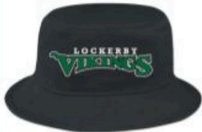
Bucket Hat $20