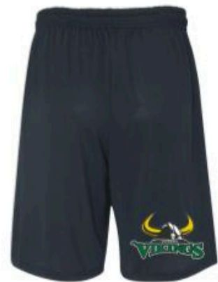
Athletic Shorts $25