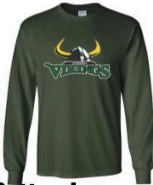
Cotton Long Sleeve T-Shirt $22